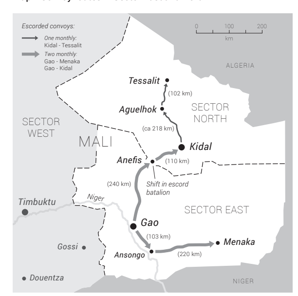
Map I: Convoy routes in Sector East and North

In total, four convoys leave Sector East every month. Two go to Menaka to the east; two to Kidal in Sector North, one of which continues to Tessalit in the far north (320 km) . The route to Kidal from Gao goes through Anefis (240km) and normally takes one day. However, if a vehicle breaks down, the trip takes two to three days. In Anefis, the convoy security unit from